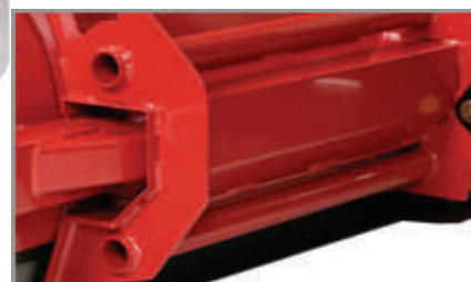
DUAL POWER BAR

Independently position each wing to maximize plow blade width and carrying capacity.