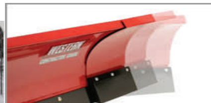
HYDRAULIC WING EXTENSIONS

Extend your options with the WESTERN® WIDE-OUT™. It's a 9-foot scoop, an 8- to 10-foot straight blade and, with the leading wing angled forward, it delivers the ultimate in high-capacity windrowing. At the touch of a button, WIDE-OUT hydraulically transforms to perfectly match every condition, delivering time-saving performance at each jobsite. The one plow that does it all — the WESTERN WIDE-OUT.