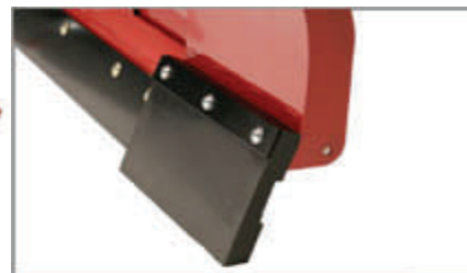
WING CUTTING EDGES

Six vertical ribs and a dual power bar design provide exceptional strength and prevent blade twisting.